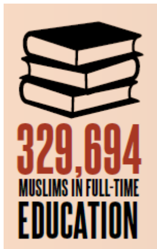
% of overall adult (16+) population who are full-time students